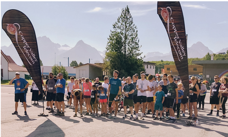
Racers line up, eager to start the 2019 CVT High Five-5K Fun Run.

For many years now, Copper Valley Telecom has hosted the annual High-Five Triathlon. However, for 2019 we decided to change things up due to the pool closure by holding a Fun Run instead, and it was a hit! It was the biggest turnout that we have had in years, and we were able to have the start and finish line right here in the Valdez CVT parking lot.