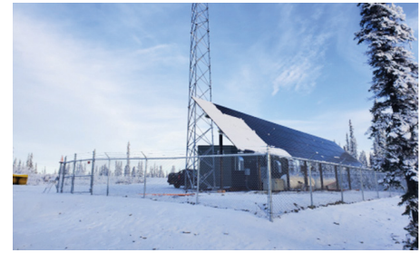
Solar panels placed at CVT's new fixed wireless site in Lake Louise.

CVT is happy to announce that in December, a cell site at Corbin Creek was turned on, as were two sites in the Gakona area. These sites enhance the LTE Data coverage for Copper