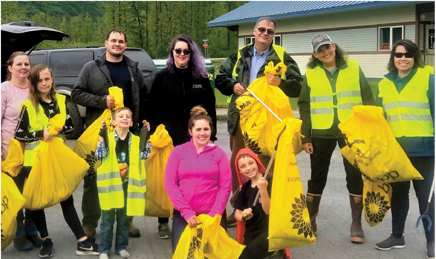
CVT volunteers pick up trash along the Richardson Highway in 2019.